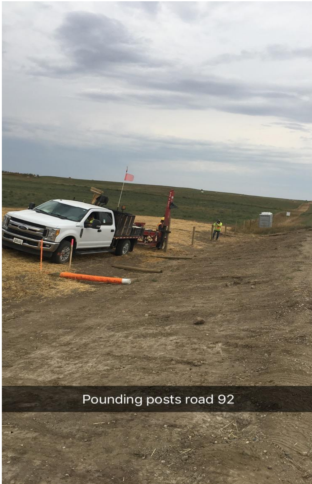
Pounding posts road 92