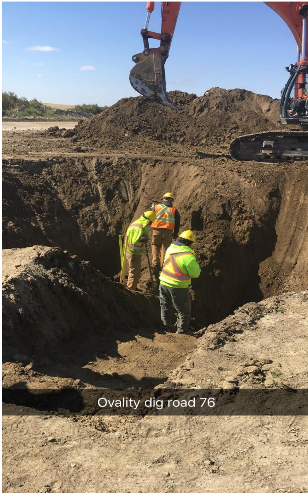
Ovality dig road 76