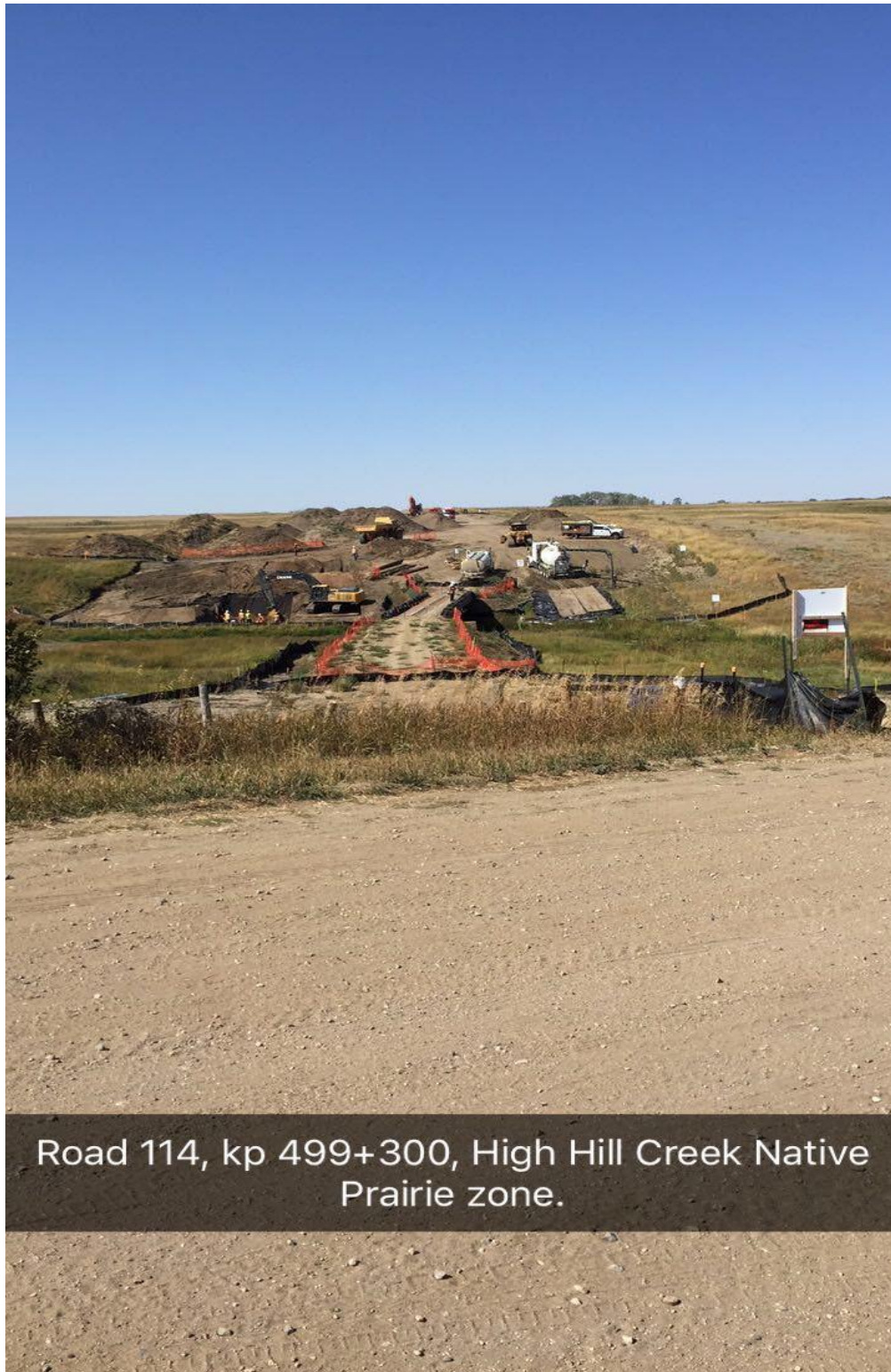
Road 114, kp 499+300, High Hill Creek Native Prairie zone.