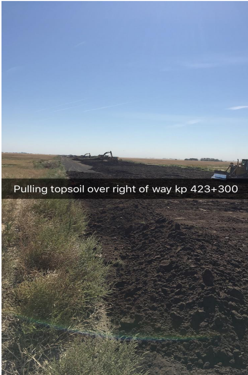
Pulling topsoil over right of way kp 423+300