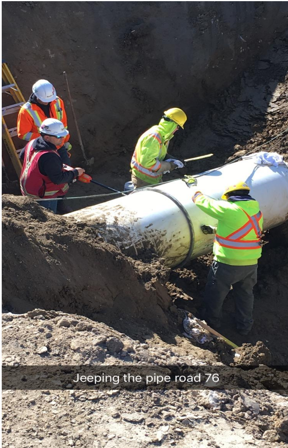
Jeeping the pipe road 76