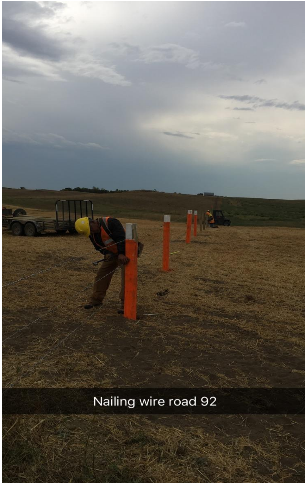
Nailing wire road 92