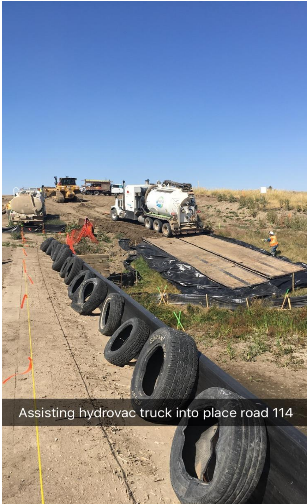
Assisting hydrovac truck into place road 114