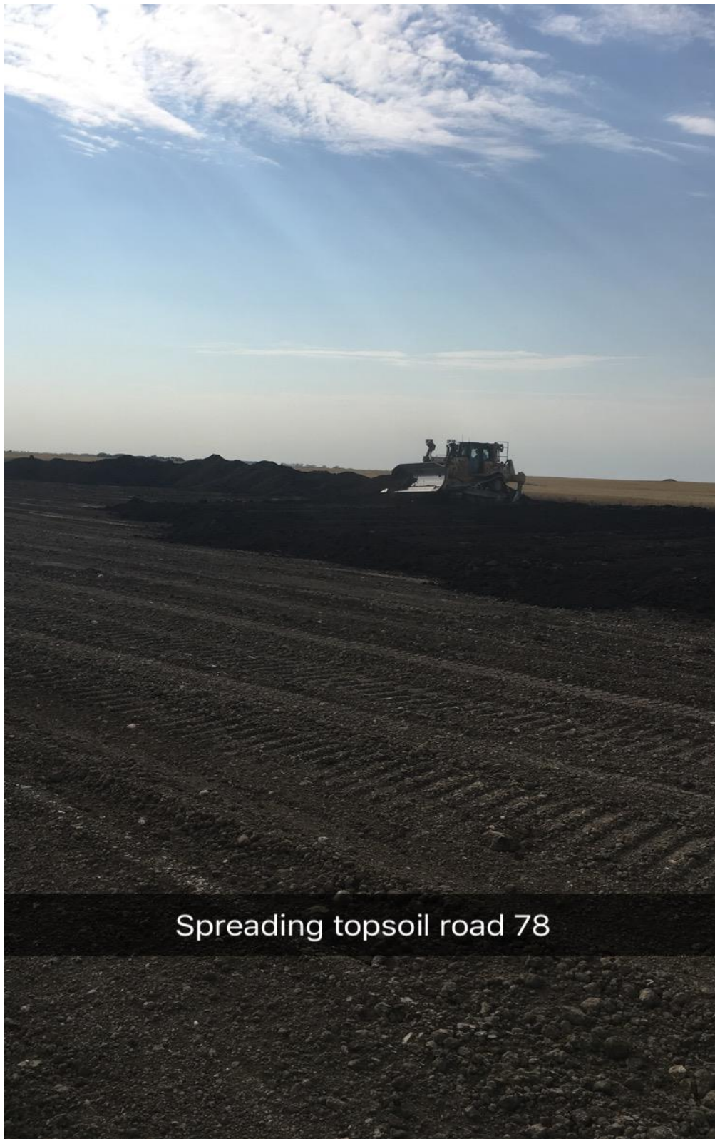
Spreading topsoil road 78